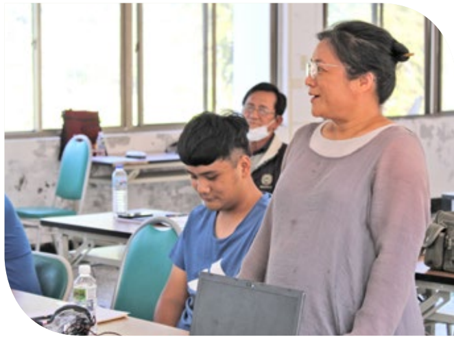
期中評鑑一用族語自我介紹。

12 vuanų 8 taniara. nimatipa cu sikingi kari. tia karamusucųkųna? ka'anų pa tavara'un. nakai maucųng cųpųngų, sii nikipatųsu cu. iimua mamanųng kara? aka kara? ka'anų cu usų'un na cųpųngų.